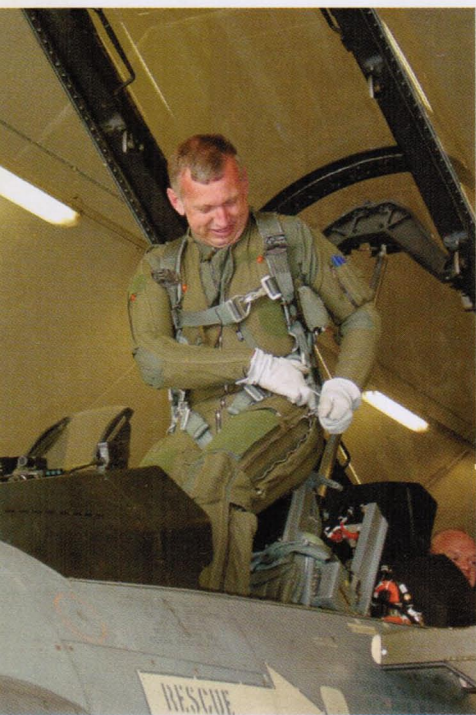
PILOTS sing the praises of the Libelle G suit.

Another task was finding a fabric that could dynamically respond to sudden changes in gravity. “We had to cover the whole body with a material that wouldn't stretch under pressure,” Reinhard remarks. “At the same time, the suit had to be flexible so the