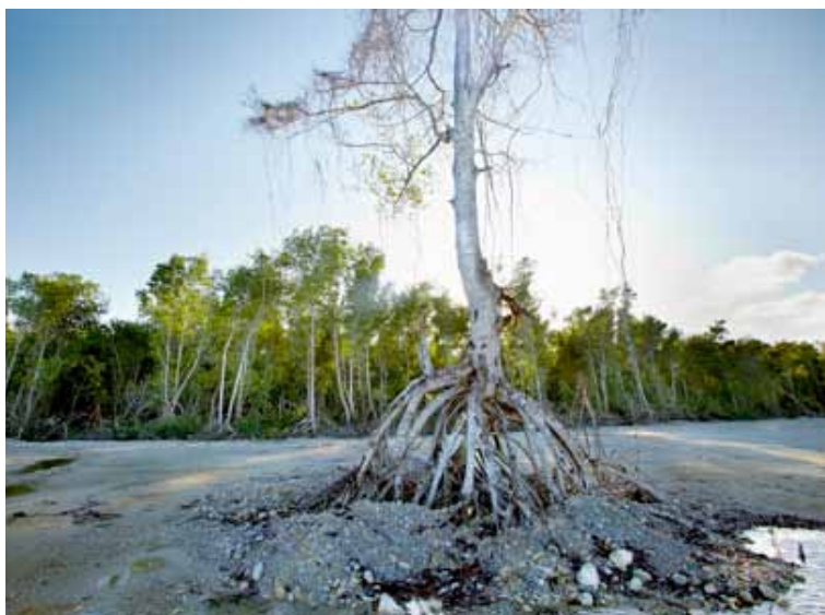
LAST TREE STANDING These former red mangrove wetlands in Falmouth, Jamaica, will be the site of a new market and a sewage treatment plant.

IMO member nations recently ratified new rules that will oblige ships to either install smokestack scrubbers or burn low-sulfur alternatives to bunker fuel, specifically marine diesel. A global mandate