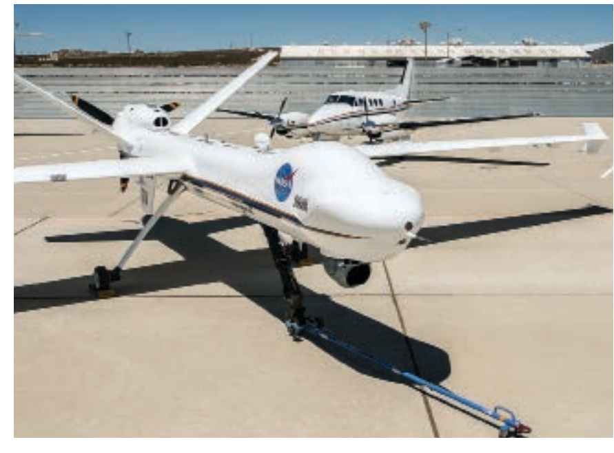
At Edwards Air Force Base in California, NASA has been conducting flight tests with a General Atomics MQ-9 UAV (foreground) and a Beech King Air (rear), which flies intrusions into the Reaper's path.

Ikhana , which has a maximum takeoff weight of 10,500 pounds, is capable of flying autonomously. Today, however, NASA pilot Herman Posada will operate it remotely, sending it commands from inside a steel-paneled ground-control