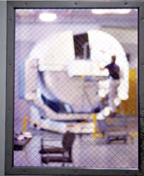
Behind the scenes at mission control, and (middle) the class suited up for flight.

“Instead of getting light-headed, I feel as though somebody parked a Mini Cooper on my chest.”