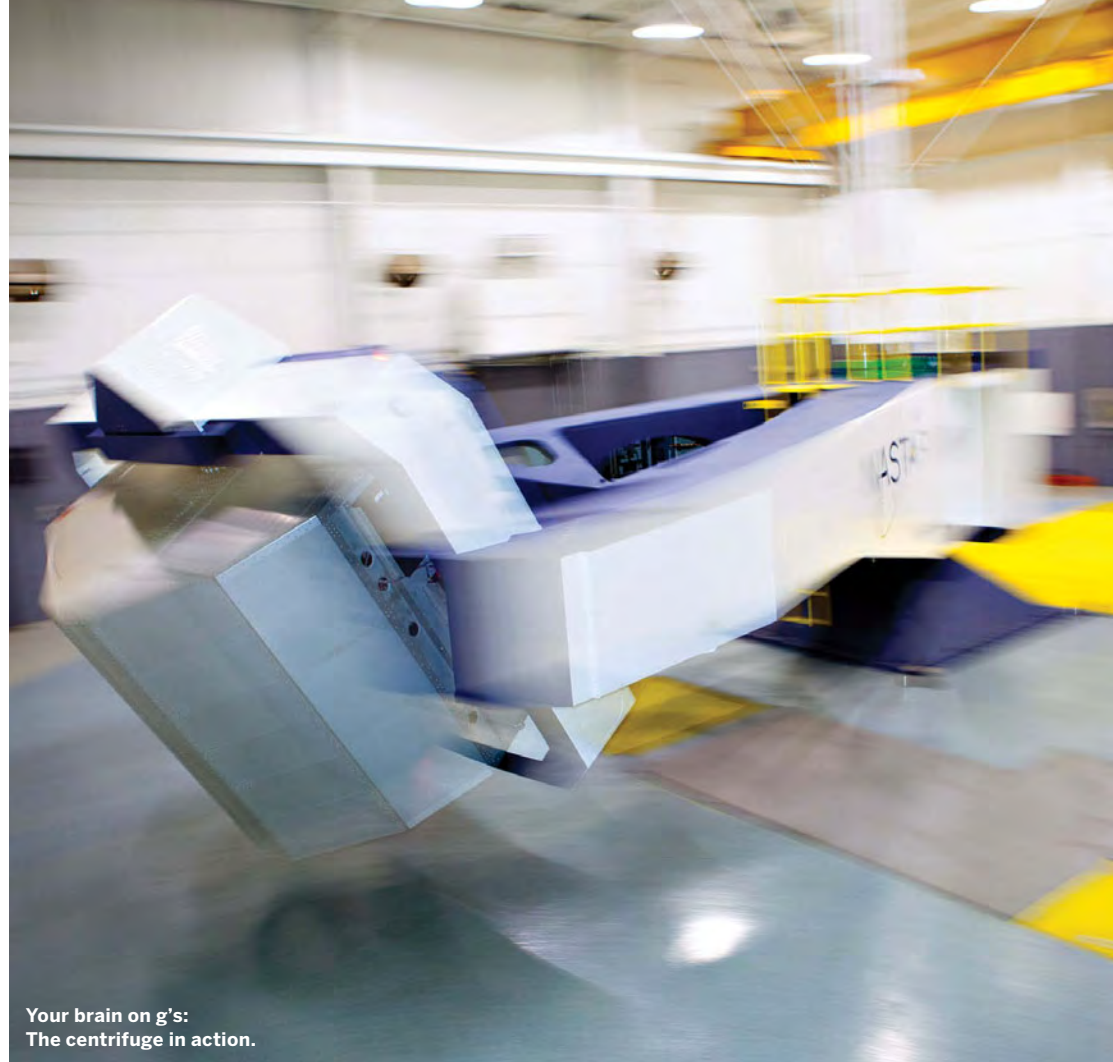
Your brain on g's: The centrifuge in action.