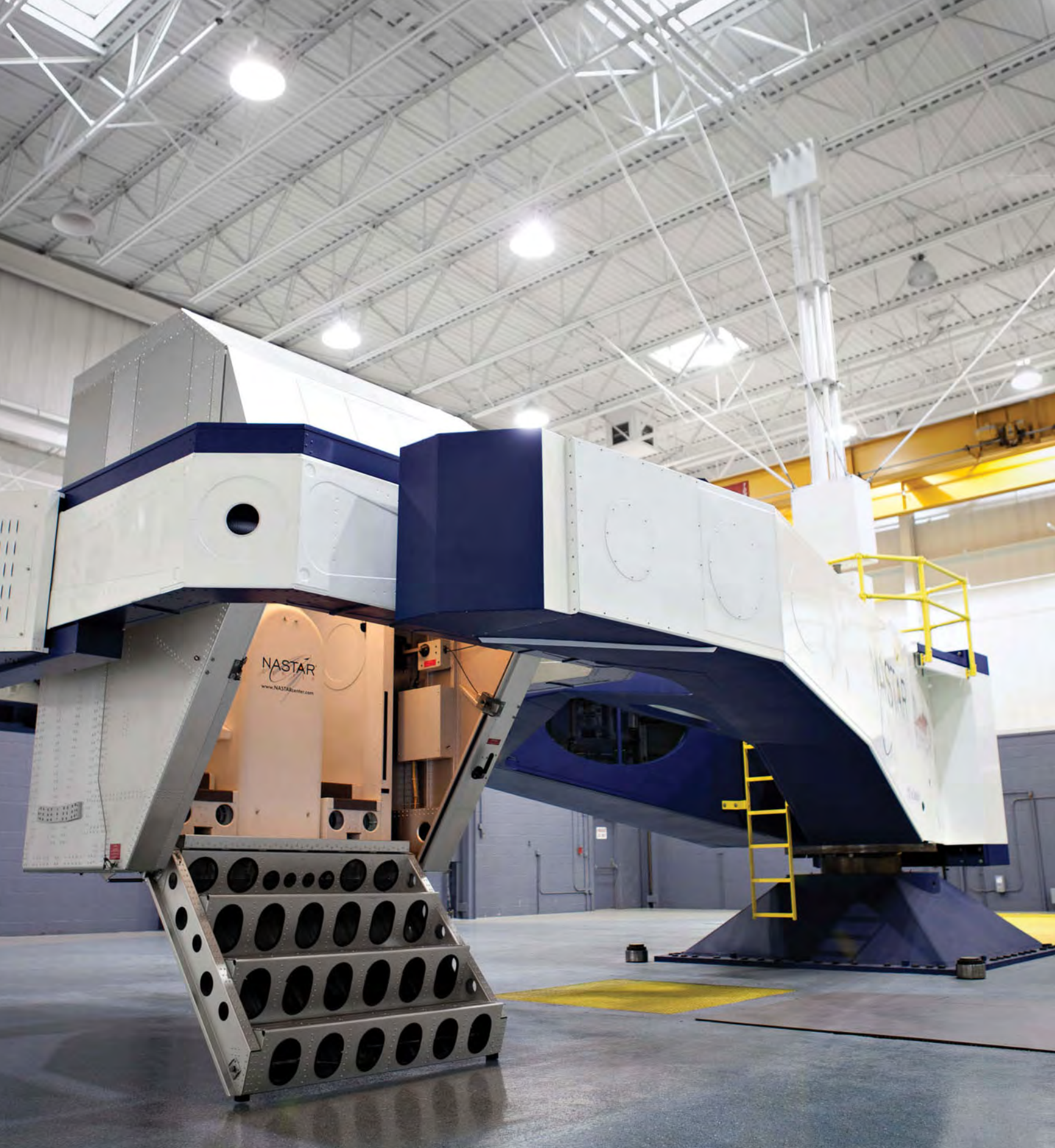
Phoenix rising: NASTAR Center's stairway to space.